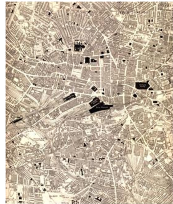
6" to 1 mile (1:10000) showing Leeds town centre. These maps are mainly useful for getting a contextual sense of a wide area.