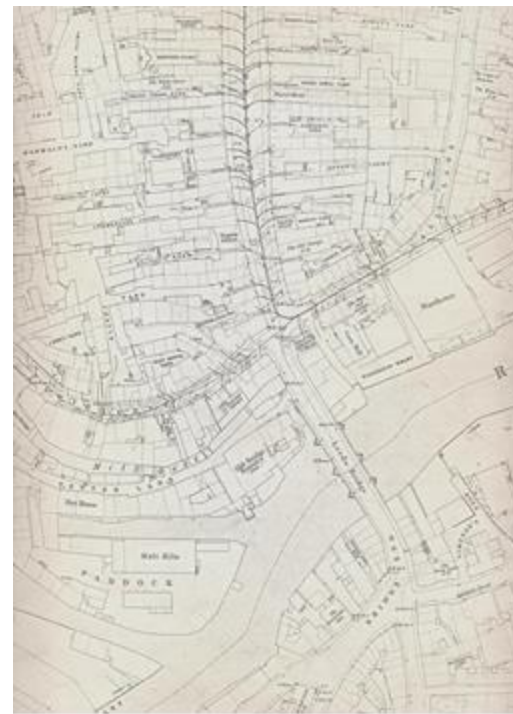
5ft to 1 mile map showing wider area around Leeds Bridge, including Briggate.