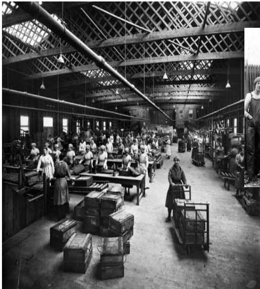
Barnbow Munitions Factory & Workers