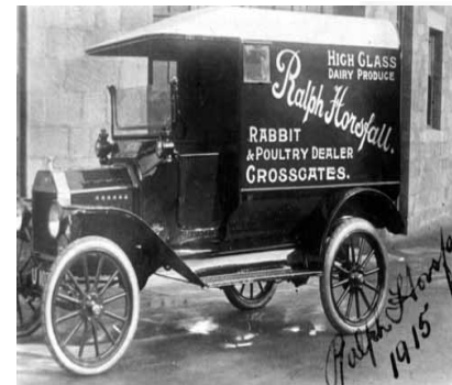
The Regal Cinema & Early Dairy Delivery Van