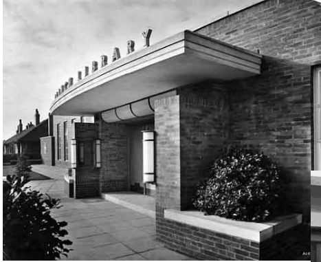
Crossgate's Library Exterior & Children's Library